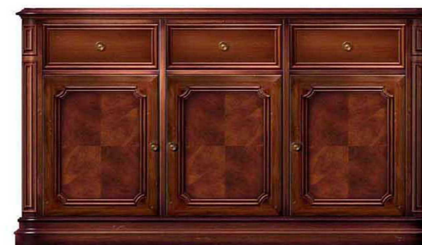
FRONT VIEW (open)