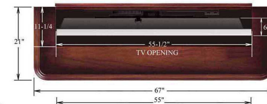
TOP VIEW (open)

Infrared relay system provides a window from your handheld remotes to your TV and audio components even though they are concealed inside the cabinet. No programming required!