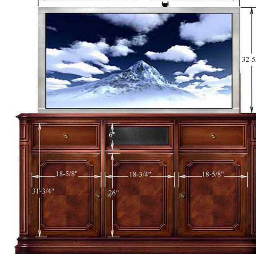
FRONT VIEW (open)