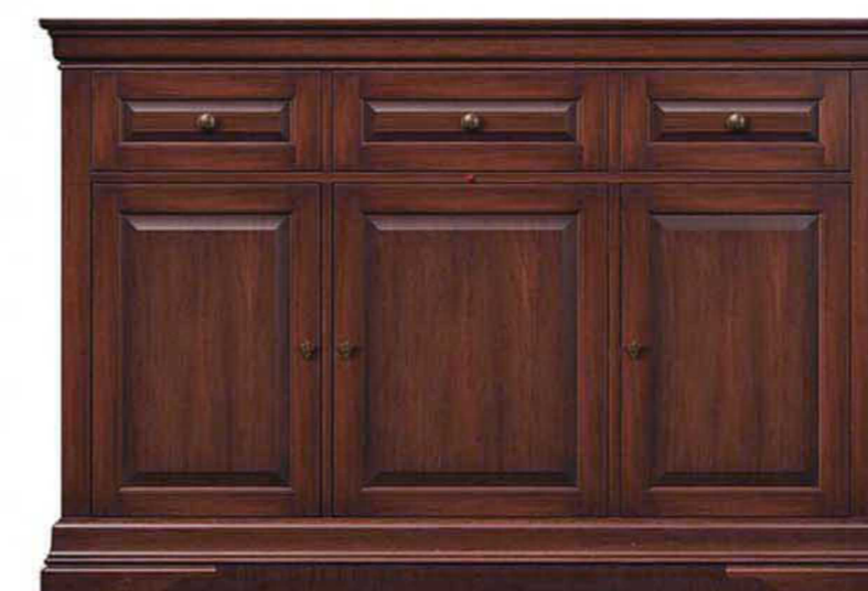
FRONT VIEW (shown with wooden panels on doors)